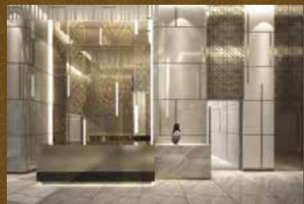
DOUBLE HEIGHT RECEPTION LOBBY