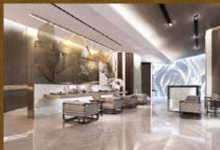
EXCLUSIVE CLUB LOUNGE